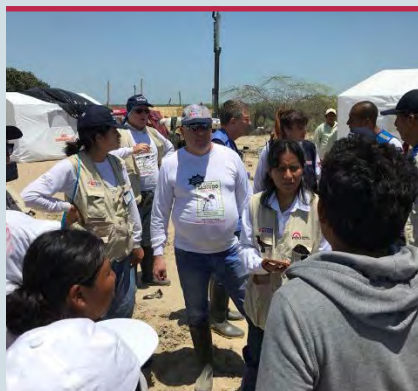
Humanitarian aid arrives to alleviate dire situation