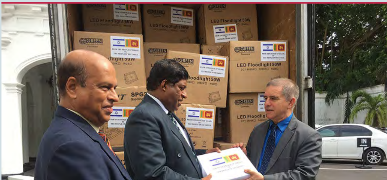
■ Emergency relief arrives in Sri Lanka.

Ambassador Carmon presented Sri Lanka's Foreign Minister Ravi Karanayake with a letter from Israel's President Reuven Rivlin expressing Israel's solidarity with the people of Sri Lanka.