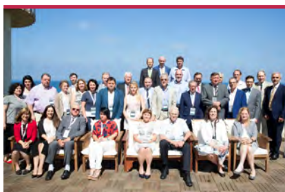
■ Delegates of the 2017 EFMA Annual Meeting, Herzliya