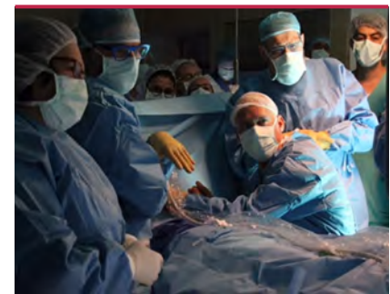
■ Hadassah Medical Center physicians performing in-utero heart surgery on July 4, 2017.