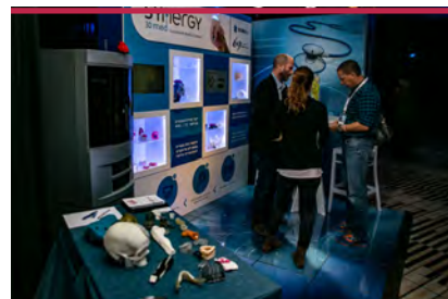
■ State-of-the-art Israeli medical devices on display at the conference

The social events were a wonderful platform to showcase the city of Haifa and were enjoyed by all, conference delegates and spouses alike. Participants enjoyed a walking tour of the Bahai Gardens, a behind the scenes foray of Rambam Hospital and a concert featuring the legendary Israeli entertainers Nurit Galron and Shlomi