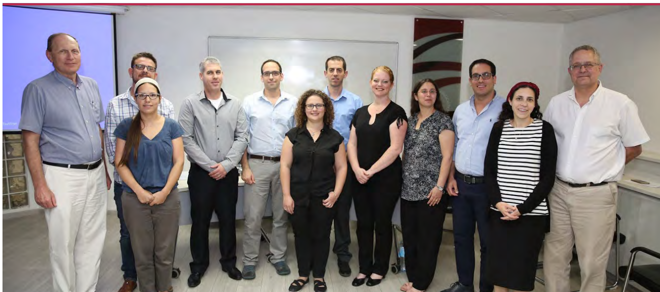
■ This year's recipients of the IMA-World Fellowship Scholarships