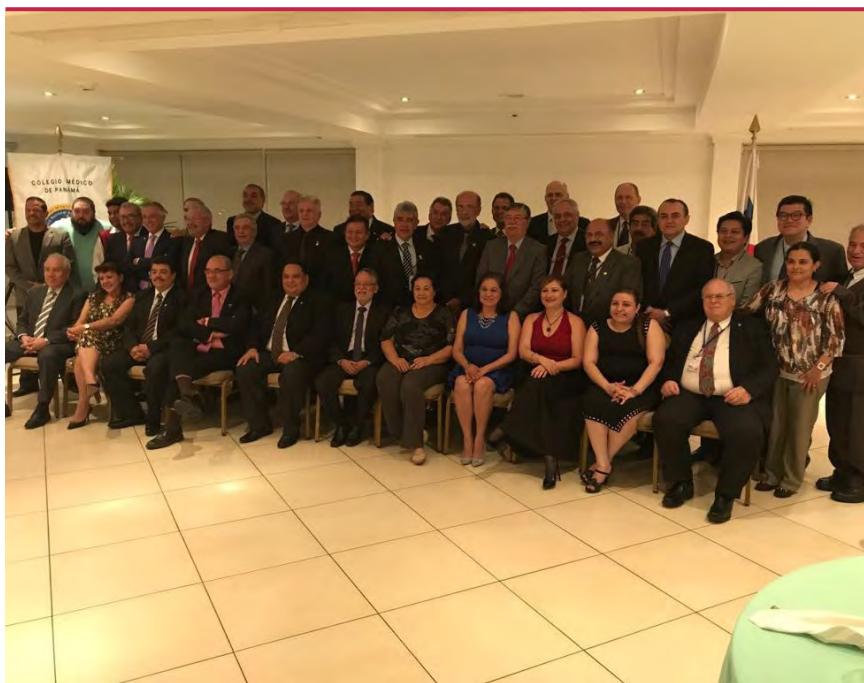
■ Delegates from over 15 countries