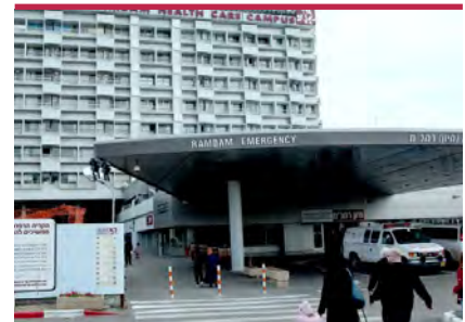
■ The Rambam Medical Center in Haifa.