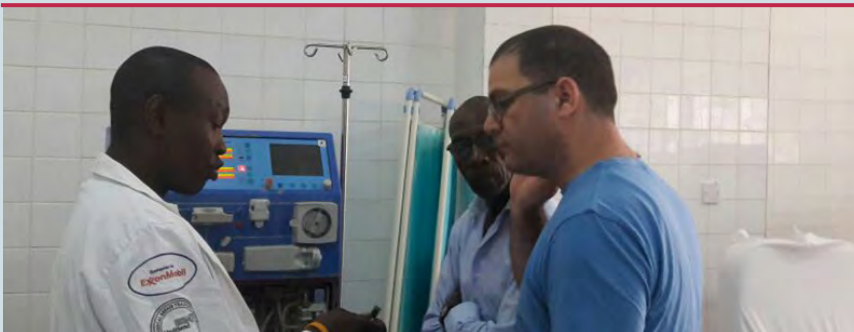
■ Training local dialysis medical teams in Sierra Leone.

MASHAV donated the unit in 2012 and training of the local medical teams commenced in Israel. However, when the Ebola crisis hit the country, the set up phase came to a halt. In late 2016, MASHAV was finally able to complete the project. The dialysis unit is fully