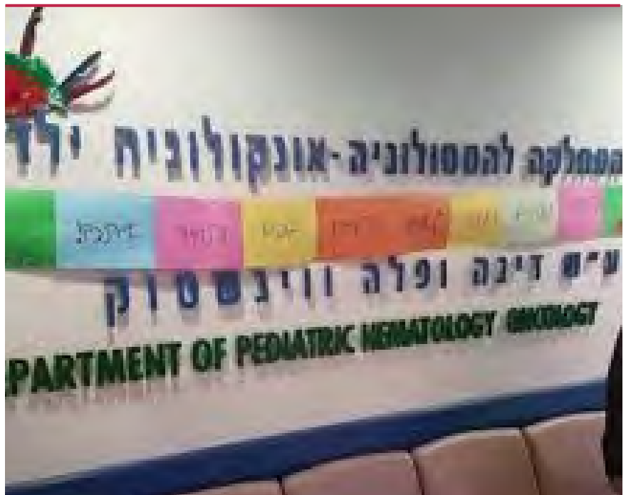
■ Entrance to the hemato-oncology unit at Hadassah Medical Center

The public debate was brimming with passion and to that end, a broader discussion focusing on the roots of the issue will be scheduled.